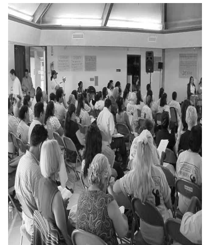
CADRE—Demonstrating parent power to end the “school-to-prison train” since 2001

4. Nearly 69 percent of parents surveyed indicated that suspensions are the consequences for student misbehavior that they hear about.