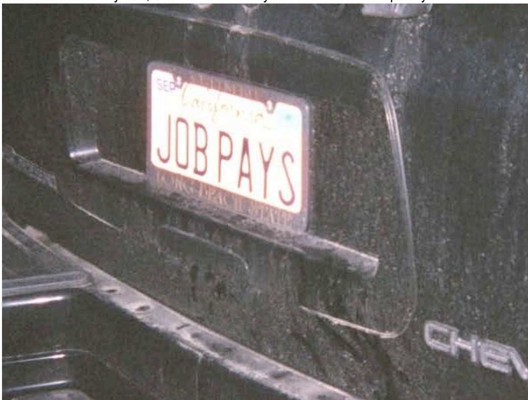
This personalized license plate appears on a Probation staff's SUV outside Camp Scott, a girl's prison in Saugus.

Until the February 13 th moratorium, the L.A. County Department of Probation charged families – over 95 percent of whom are poor and working class – as much as $23.63 dollars for each day – or nearly $750 each month – that their child was in juvenile hall, and $11.94 for each day they were in camp. The majority of the fees were charged to families while the child was in juvenile hall, so parents are also being held financially accountable for the slow movement of cases through court. In some cases, families have also received bills prior to the case's disposition, meaning that youth who are potentially innocent of all charges were still billed.