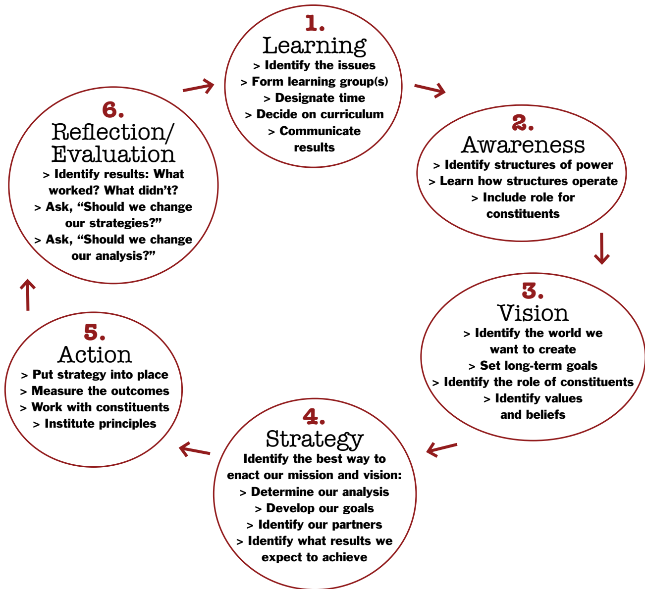
Figure 2: The Transformation Process

>> This process opens up opportunities to find new allies and become a part of something bigger.