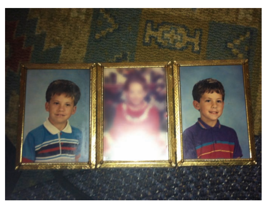
Family photos of two boys at ages 10 and 8 (now adults in their late twenties) who were subject to sex offender registration for offenses committed at ages 12 and 10. Individuals aware of their registration have thrown molotov cocktails through the window of the family home, as well as threatened, insulted, and shouted profanities at all members of the family. Weatherford, Texas, May 1, 2012.